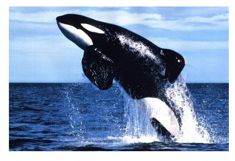
What Would I Be?

If there was a process called reincarnation I'd come back as a whale, to play in the ocean The sea would provide all I need I wouldn't have a mortgage or bills Instead, I'd have free sunset dinners and a carefree life full of frolic and thrills.