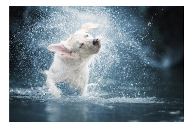
See you next month!