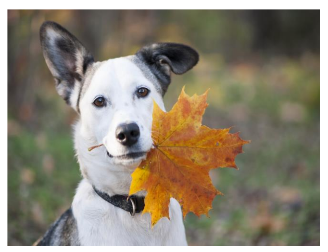
See you next month!